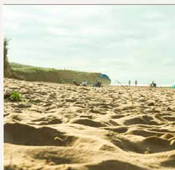
Gulf of St. Lawrence